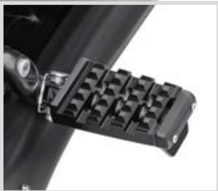
D. DOMINION FOOTPEGS – GLOSS BLACK