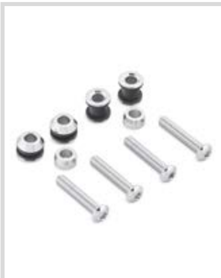
H. DOCKING HARDWARE