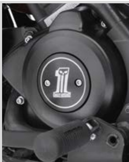
C. DARK CUSTOM LOGO COLLECTION – LEFT SIDE MEDALLION