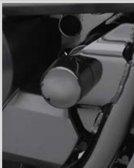
D. SWINGARM PIVOT BOLT COVERS – GLOSS BLACK