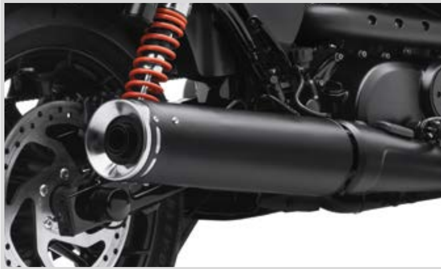
E. SCREAMIN' EAGLE STREET PERFORMANCE SLIP-ON MUFFLER

These street-compliant high-flow mufflers have been specifically tuned to deliver an aggressive exhaust note and improved performance. Developing a rich exhaust note throughout the RPM range, these mufflers provide deep bass rumble and a throaty tone while on the throttle. The heat-resistant satin black ceramic finish complements the blacked-out look of the Street Rod® model, and the contrasting bright stainless end cap is finished with a laser-engraved Screamin' Eagle logo for a finishing touch.