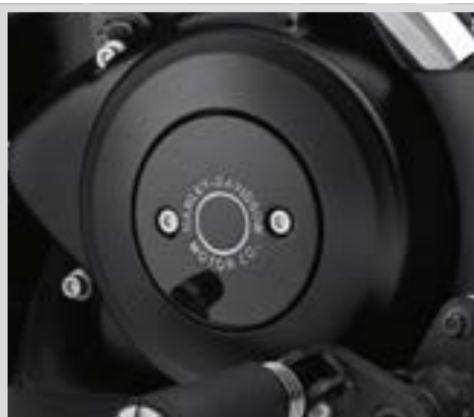
H. HARLEY-DAVIDSON MOTOR CO. COLLECTION BLACK WITH CHROME SCRIPT – LEFT SIDE MEDALLION

Not all products are available in all countries – please consult your dealer for details.