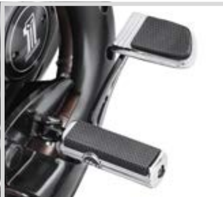
G. DEFIANCE COLLECTION HAND AND FOOT CONTROLS – CHROME