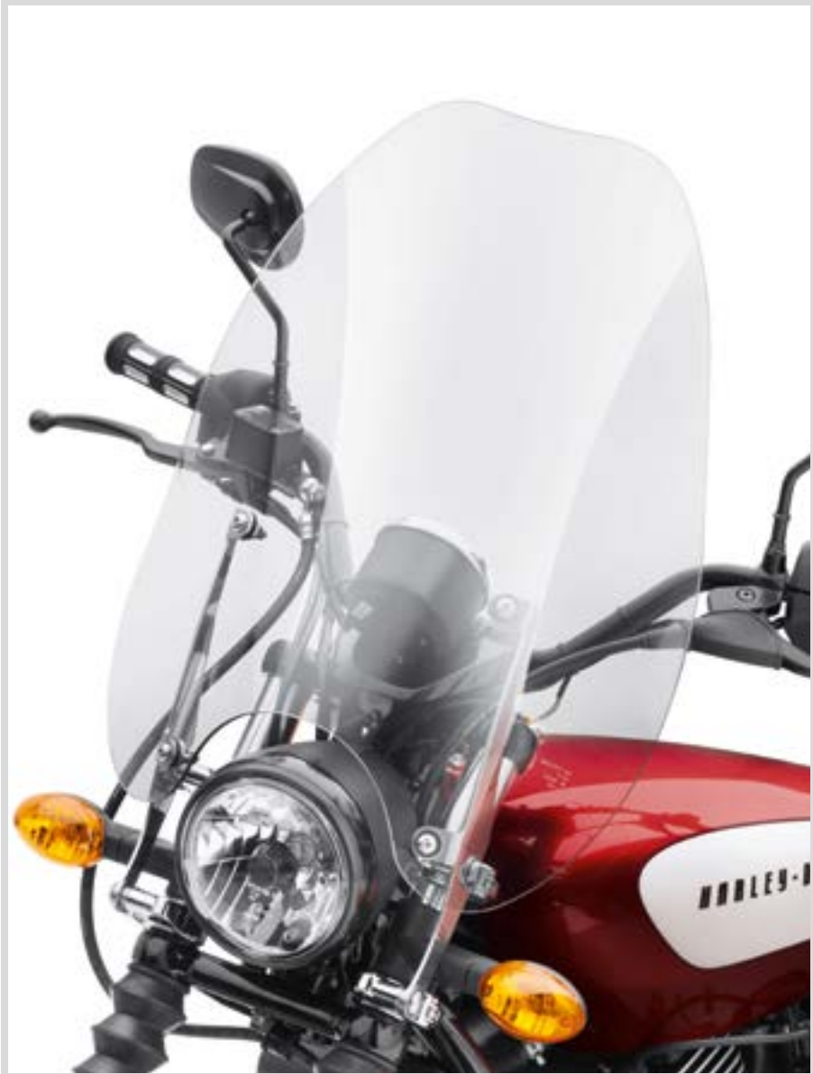
A. QUICK-RELEASE SUPER SPORT WINDSHIELD