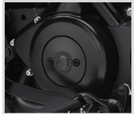
A. WILLIE G SKULL COLLECTION – LEFT SIDE MEDALLION – BLACK