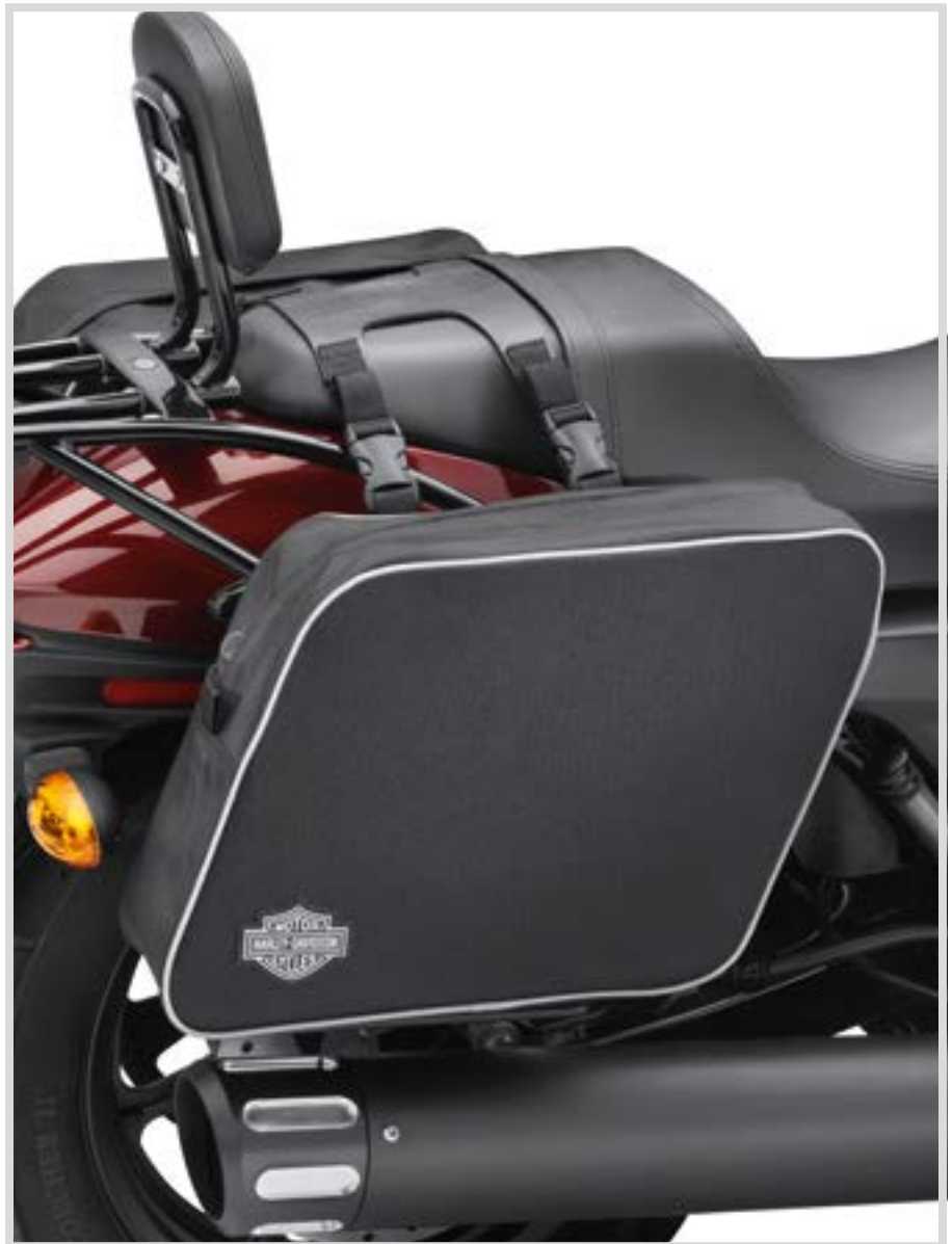
A. THROW-OVER SADDLEBAGS

Fits models with steel fuel tanks or airbox covers.