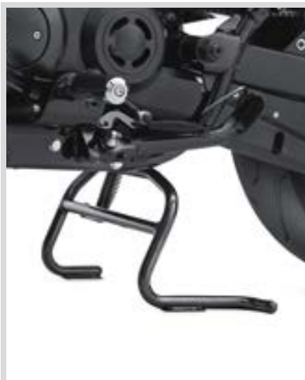
F. CENTER STAND