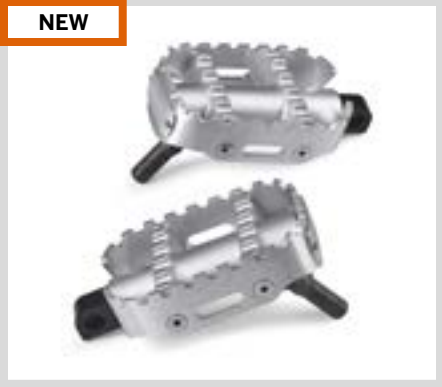
A. 80GRIT FOOTPEGS – RAW