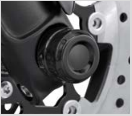
A. DOMINION FRONT AXLE NUT COVERS – GLOSS BLACK

Fits '02-'11 VRSC (except VRSCF and VRSCR), '15-later XG, '08-later XL (except '16-later XL1200X and XL1200XS), '08-'17 Dyna, '07-later Softail (except Springer, FLSTNSE, FLSB, FXCW, FXCWC, FXDRS, FXFB, FXFBS, FXLRS, FXSB, FXSBSE, FXSE, FXST-Aus, and FXSTD) and '08-later Touring and Trike models. '18-later Softail models require separate purchase of Front Axle Adapter Kit P/N 43000090.