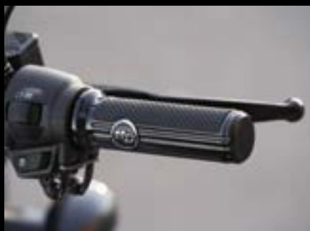
Defiance Hand Grips .....p25