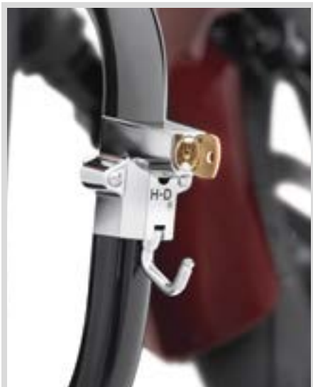
E. UNIVERSAL MOUNT HELMET LOCK