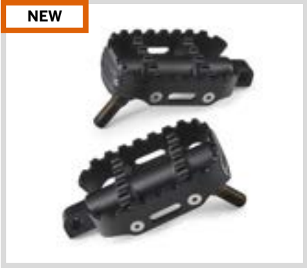
A. 80GRIT FOOTPEGS – BLACK