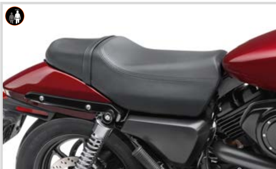
E. TALLBOY SEAT