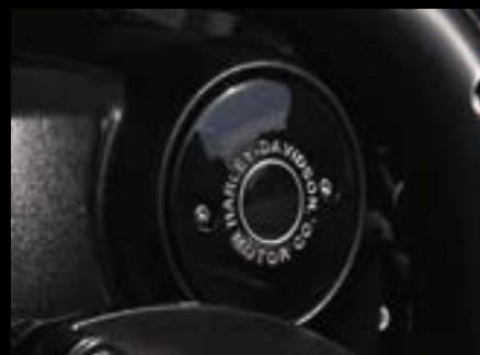
Harley-Davidson Motor Co. Right Side Medallion .....p27