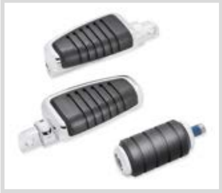
C. KAHUNA COLLECTION FOOT CONTROLS – CHROME