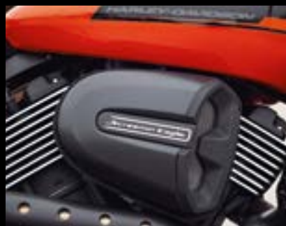
Screamin' Eagle Performance Air Cleaner Kit ..... p32