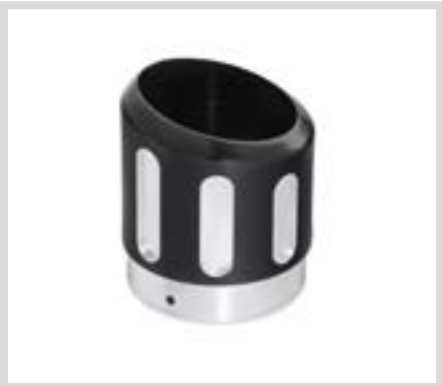
D. MUFFLER END CAP – EDGE CUT