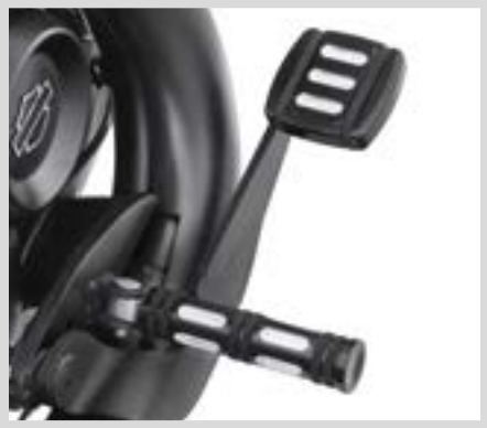
D. EDGE CUT COLLECTION HAND AND FOOT CONTROLS