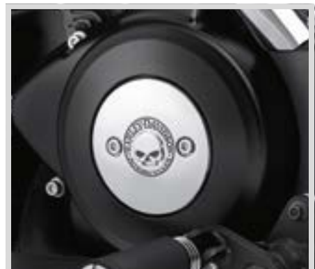
B. WILLIE G SKULL COLLECTION – LEFT SIDE MEDALLION – CHROME

Not all products are available in all countries – please consult your dealer for details.