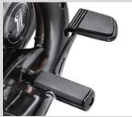
E. DEFIANCE COLLECTION HAND AND FOOT CONTROLS – BLACK ANODIZED