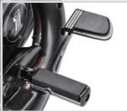
F. DEFIANCE COLLECTION HAND AND FOOT CONTROLS – BLACK MACHINE CUT