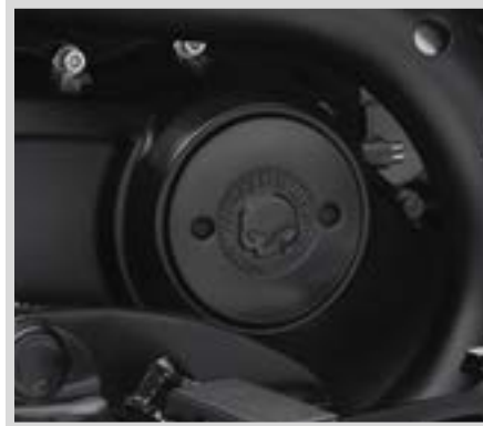
A. WILLIE G SKULL COLLECTION – RIGHT SIDE MEDALLION – BLACK