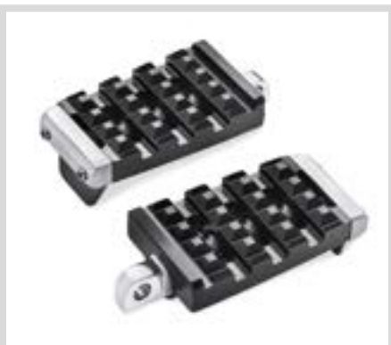
F. DOMINION FOOTPEG TRIM PIECE (BRUSHED ALUMINUM SHOWN)