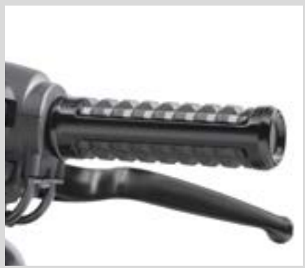
C. DOMINION HAND GRIPS – GLOSS BLACK