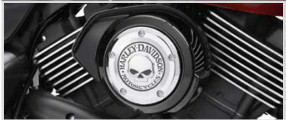
B. WILLIE G SKULL COLLECTION – AIR CLEANER TRIM – CHROME