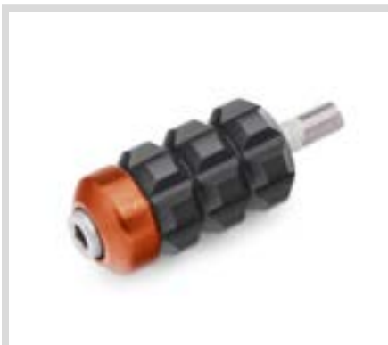
F. DOMINION SHIFTER PEG TRIM PIECE (BRUSHED ORANGE SHOWN)

Express your bold, renegade attitude. The Dominion Collection Rider and Passenger Controls let you set your own styling direction.