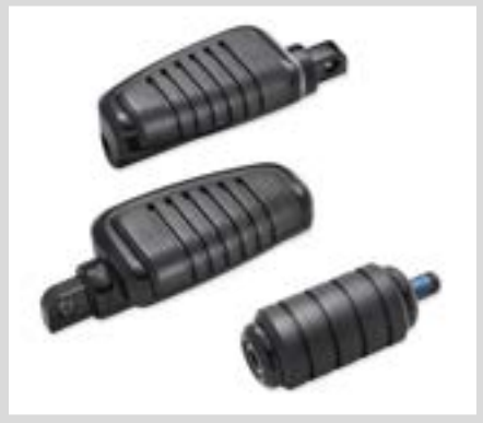
C. KAHUNA COLLECTION FOOT CONTROLS – GLOSS BLACK