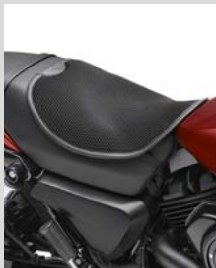
B. CIRCULATOR SEAT PAD (RIDER SHOWN)