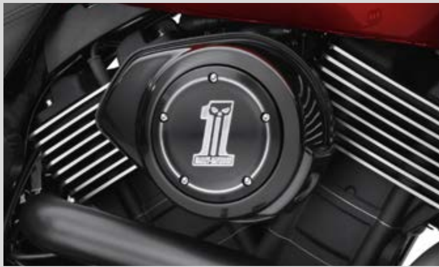
C. DARK CUSTOM LOGO COLLECTION – AIR CLEANER TRIM

Make a bold statement with these easy-to-install, black anodized and machined billet medallions.