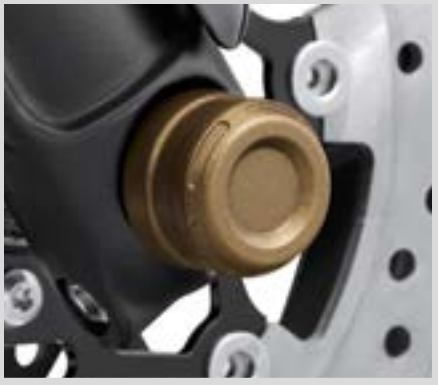
A. DOMINION FRONT AXLE NUT COVERS – BRONZE