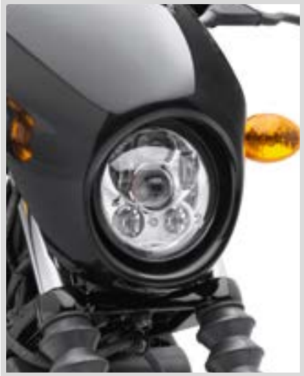
B. DAYMAKER LED HEADLAMPS – CHROME