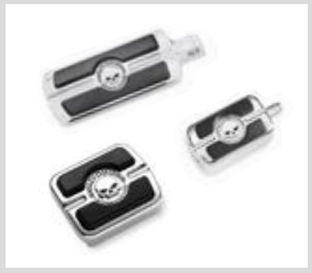
B. WILLIE G SKULL COLLECTION FOOT CONTROLS – CHROME