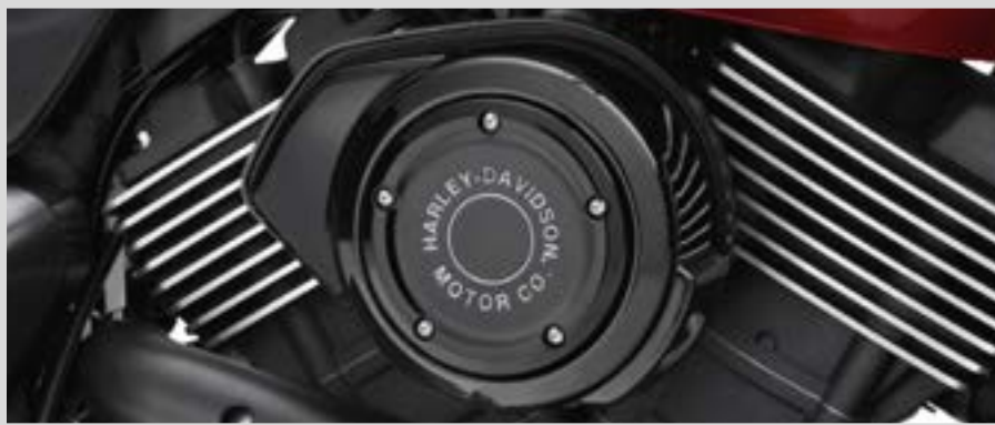
H. HARLEY-DAVIDSON MOTOR CO. COLLECTION BLACK WITH CHROME SCRIPT – AIR CLEANER TRIM

25700308 Left Side Medallion. Fits '15-later XG models.