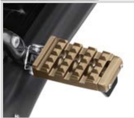
D. DOMINION FOOTPEGS – BRONZE