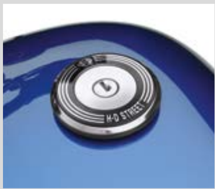
G. FUEL CAP MEDALLION – H-D STREET SCRIPT