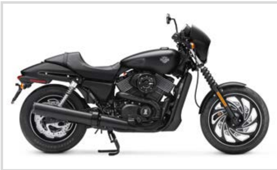
F. CENTER STAND