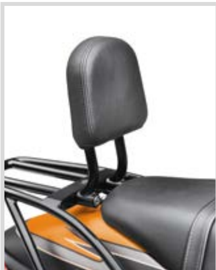
G. COMPACT PASSENGER BACKREST PAD