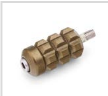
E. DOMINION SHIFTER PEG – BRONZE