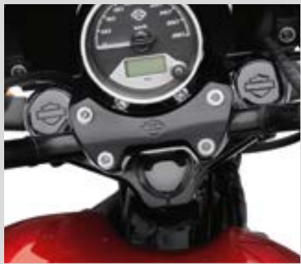
E. FORK TUBE AND STEERING STEM COVER KIT – GLOSS BLACK