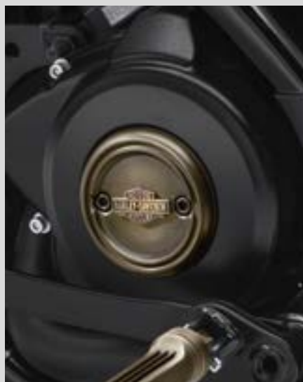
D. BRASS COLLECTION – LEFT SIDE MEDALLION

Not all products are available in all countries – please consult your dealer for details.