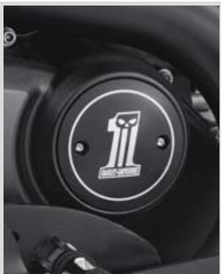
C. DARK CUSTOM LOGO COLLECTION – RIGHT SIDE MEDALLION