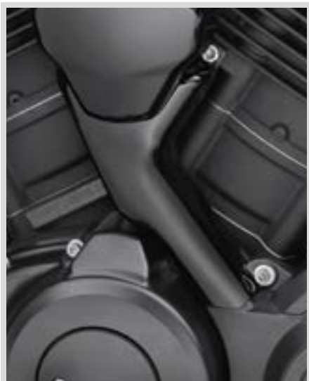
E. COOLANT HOSE COVER KIT – GLOSS BLACK