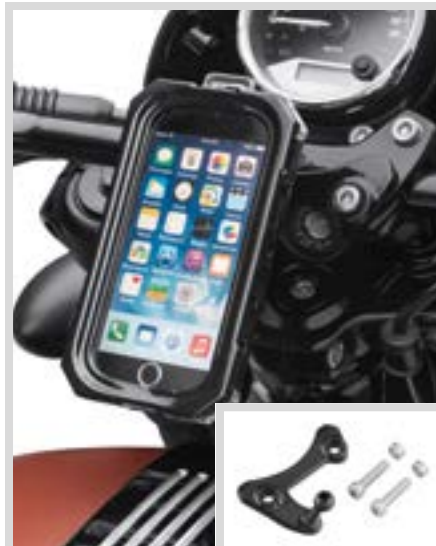
B. PHONE CARRIER MOUNT