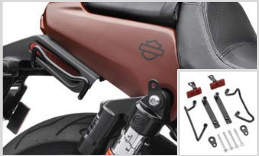
D. BUNGEE BARS – STREET ROD MODEL