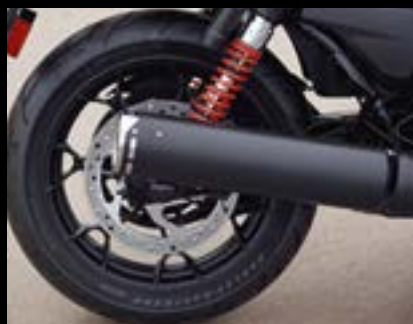
Screamin' Eagle® Slip-On Muffler ..... p33