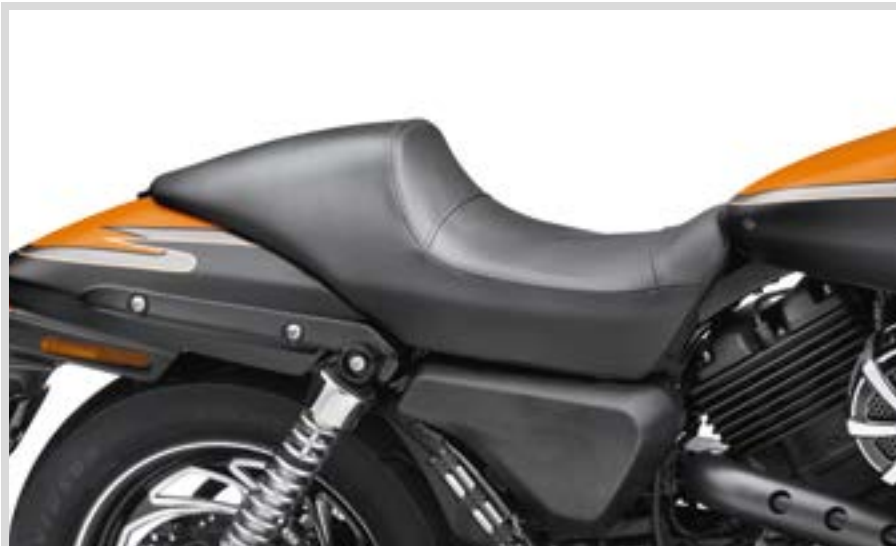
C. CAFÉ SOLO SEAT

There's something about the placement of the rider that makes the Café Solo Seat special. The one-up design and the high back pad hold the rider in place and provide a direct connection to the bike. You sit "in" the bike and your hands and feet reach naturally to the controls. The low-slung pad, narrow nose and the tapered tail enhance the bike's sporting profile and pay homage to the heritage of the iconic Café Racer style.