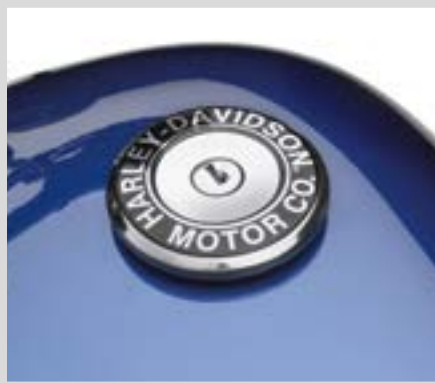
G. FUEL CAP MEDALLION – H-D MOTOR CO SCRIPT

An aggressive twist on a classic style. The Harley-Davidson Motor Co. Collection features a rich gloss black surface, trimmed with deep-cut silver-filled lettering that surrounds a central groove. The clean design and the luxurious finish are the perfect match for blacked-out engine cases.