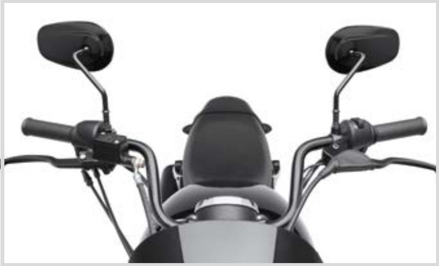
A. REACH HANDLEBAR

*NOTE: Installation of some handlebars and risers may require a change in clutch and/or throttle cable and brake lines for some models.