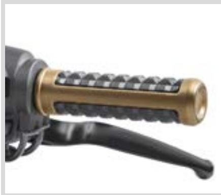
C. DOMINION HAND GRIPS – BRONZE