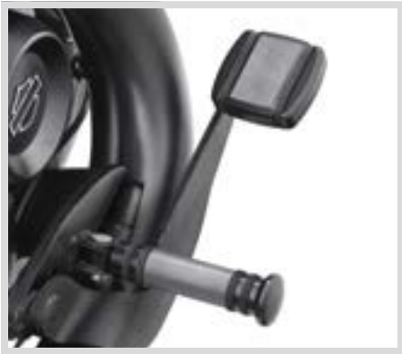
D. DIAMOND BLACK COLLECTION FOOT CONTROLS