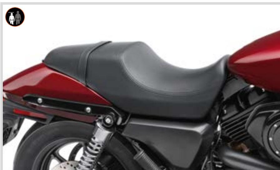
D. REACH SEAT

Fits '15-later XG models (except XG750A). Seat width 10.5"; passenger pillion width 7.5".