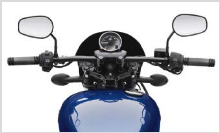
B. DRAG HANDLEBAR