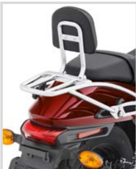
F. SISSY BAR UPRIGHT (SHOWN WITH LUGGAGE RACK AND BACKREST PAD)

Fits '15-later XG models (except XG750A).