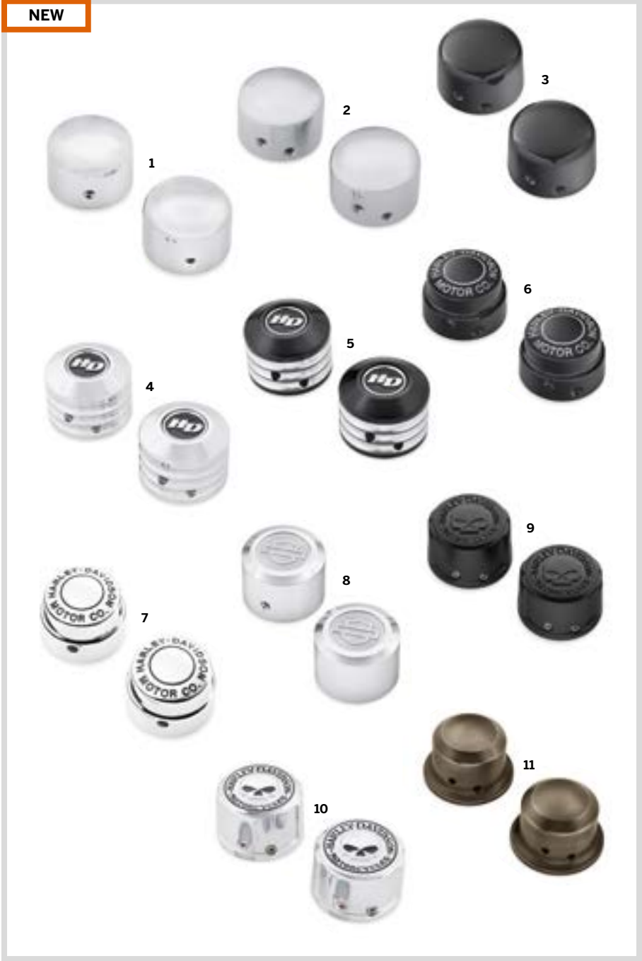
B. FRONT AXLE NUT COVERS