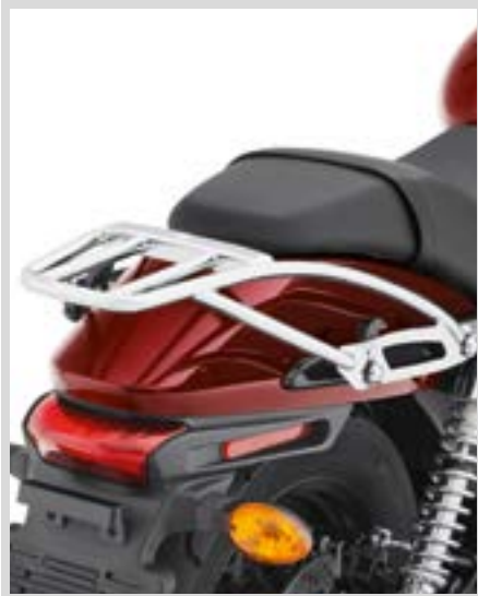
E. H-D DETACHABLES TWO-UP LUGGAGE RACK