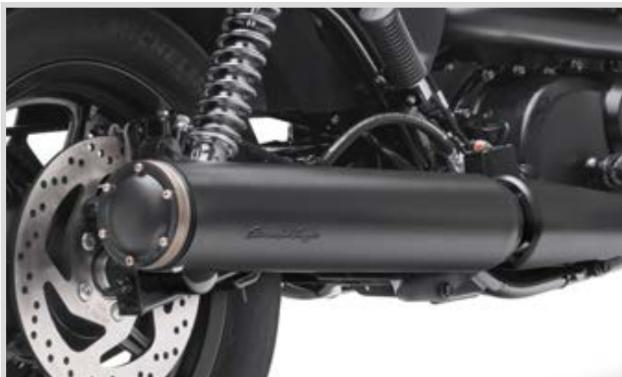
F. SCREAMIN' EAGLE NIGHTSTICK 2-INTO-1 SLIP-ON MUFFLER – JET BLACK