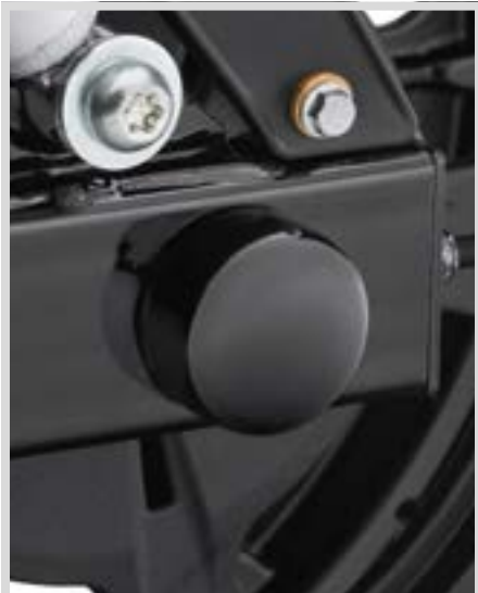
C. REAR AXLE NUT COVERS – GLOSS BLACK