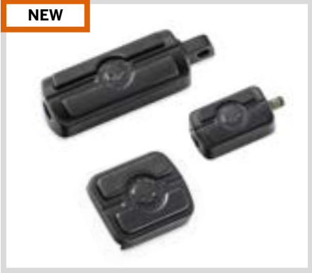
B. WILLIE G SKULL COLLECTION FOOT CONTROLS – BLACK