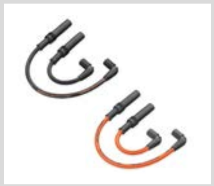
C. SCREAMIN' EAGLE 10MM PHAT SPARK PLUG WIRES