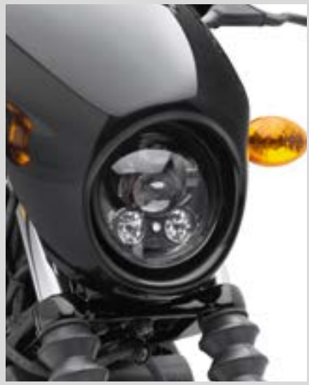
B. DAYMAKER LED HEADLAMPS – GLOSS BLACK