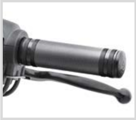
D. DIAMOND BLACK COLLECTION HAND GRIPS