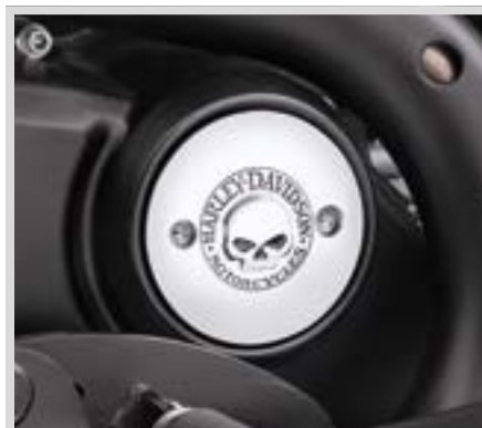
B. WILLIE G SKULL COLLECTION – RIGHT SIDE MEDALLION – CHROME