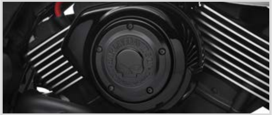
A. WILLIE G SKULL COLLECTION – AIR CLEANER TRIM – BLACK