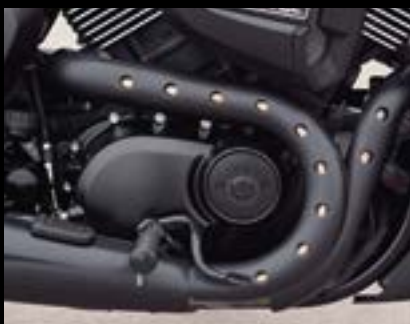
Buckshot Exhaust Shield..... p33