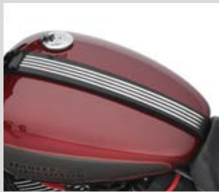
F. FUEL TANK TRIM – GLOSS BLACK MACHINED

Highlighted with an embossed Bar & Shield® logo, these smooth covers enhance the clean look of the upper triple tree. Easy-to-install kit includes two press-in fork tube covers and a moon-shaped steering stem cover.