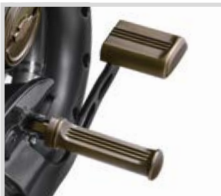
H. BRASS COLLECTION HAND AND FOOT CONTROLS

Show your complete disregard for the rules. Anything but traditional, this complete collection of hand and foot controls refuses to conform to the everyday norms. Defined by sweeping curves, this design features a field of textured black rubber accented with deep longitudinal lines and a contemporary H-D logo. Available in your choice of chrome, black machine cut or full black finishes, the Defiance Collection sets a new rebellious direction in customizing.