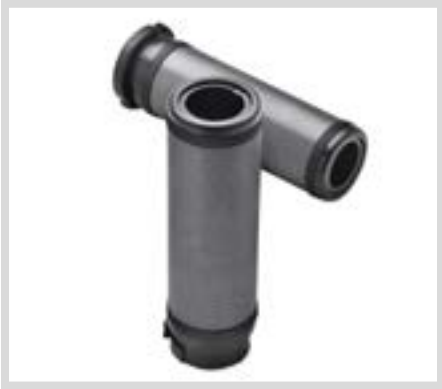
B. DIAMOND-BLACK HAND GRIPS