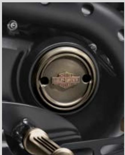
D. BRASS COLLECTION – RIGHT SIDE MEDALLION