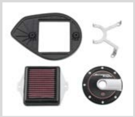
B. SCREAMIN' EAGLE PERFORMANCE AIR CLEANER KIT – STREET

Fat 10mm plug wires add dimension and style to your ride. Screamin' Eagle boot design and suppression core wires ensure solid connection and maximum voltage transfer between coil and plugs. Screamin' Eagle logo printed along the wire to add style.