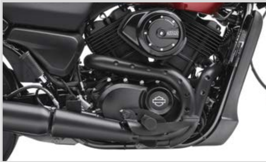
G. SCREAMIN' EAGLE BUCKSHOT EXHAUST SHIELD KIT – JET BLACK

*Not certified for use in markets that follow EU regulation 168/2013.