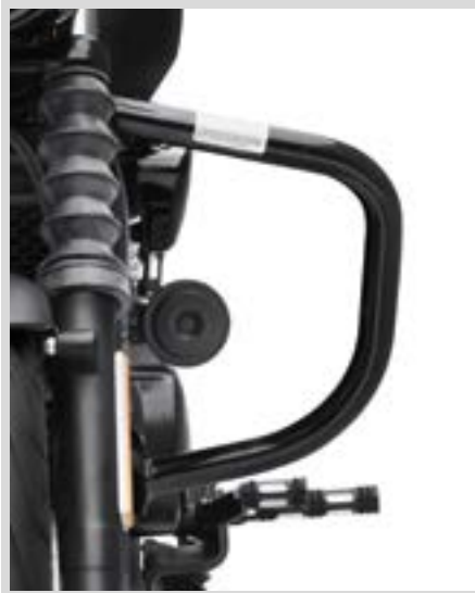
D. ENGINE GUARD – GLOSS BLACK