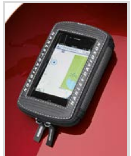
C. MUSIC PLAYER TANK POUCH