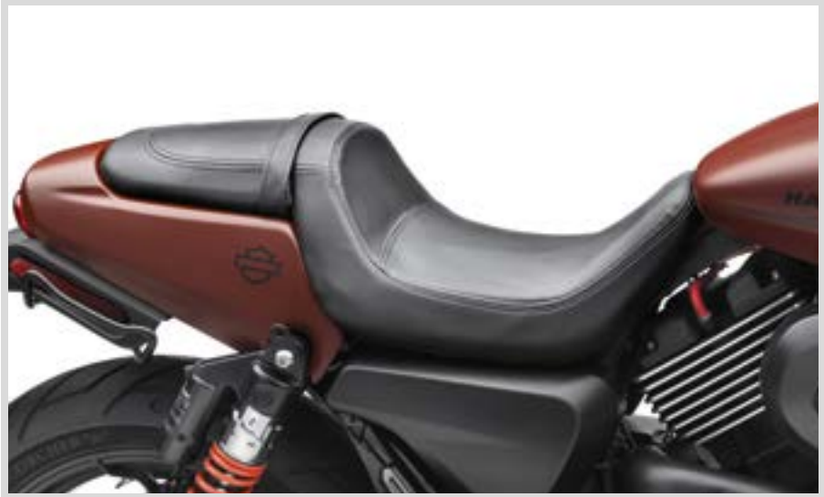
A. REACH RIDER SEAT – STREET ROD MODEL