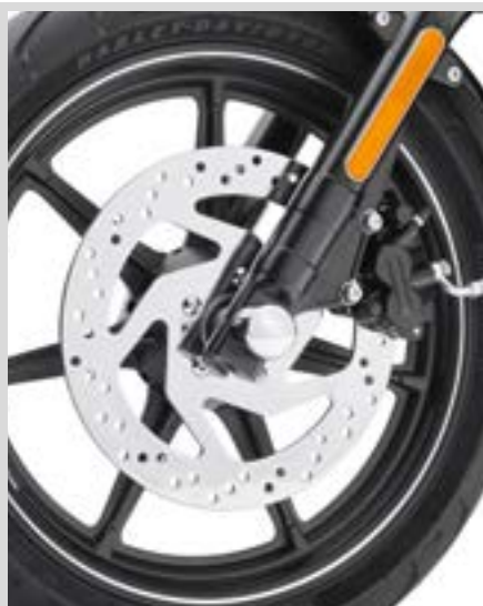
G. POLISHED BRAKE ROTORS

Cover the rear axle in style. These smooth Axle Nut Covers look great and add the finishing touch to complete the custom look. These easy-to-install Axle Cover Kits include all necessary mounting hardware. Sold in pairs.