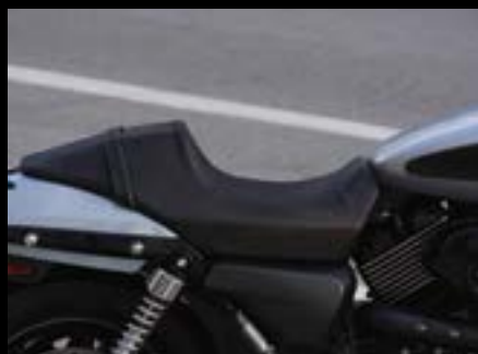
Café Solo Seat .....p17