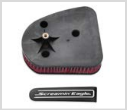
A. SCREAMIN' EAGLE PERFORMANCE AIR CLEANER KIT – STREET ROD

This kit provides a freer breathing capability to pump up the power of your EFI-equipped motorcycle. Air Cleaner features a washable high-flow, oiled cotton media element. Kit includes a high-flow air filter element, Screamin' Eagle Air Cleaner Medallion and all required hardware. 50-State U.S. EPA compliant.