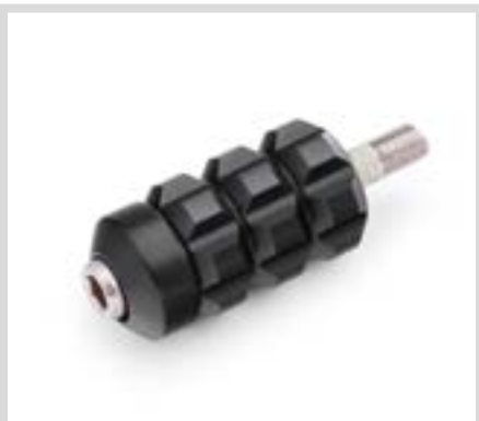
E. DOMINION SHIFTER PEG – GLOSS BLACK