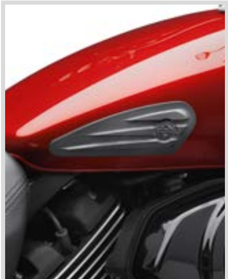
C. TANK KNEE PAD KIT