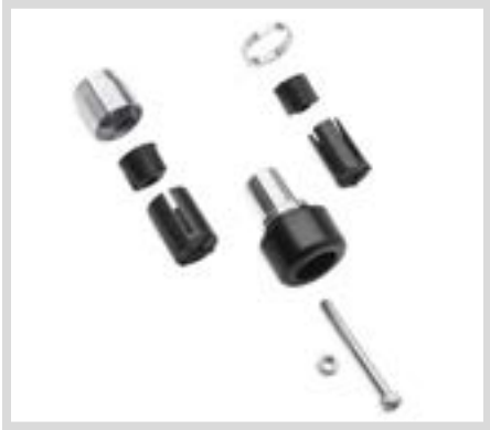
C. HAND GRIP END CAPS