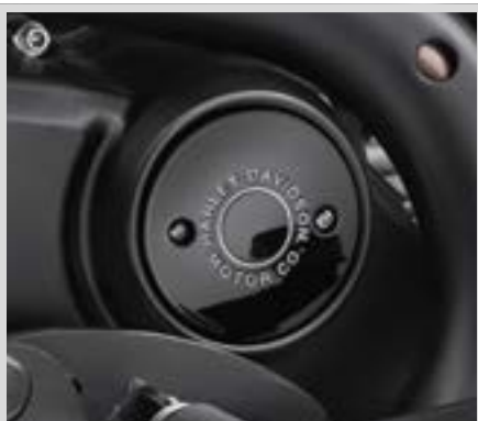
H. HARLEY-DAVIDSON MOTOR CO. COLLECTION BLACK WITH CHROME SCRIPT – RIGHT SIDE MEDALLION